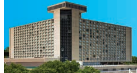
The Westin Kansas City