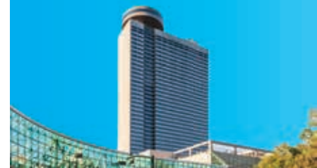
Sheraton Kansas City